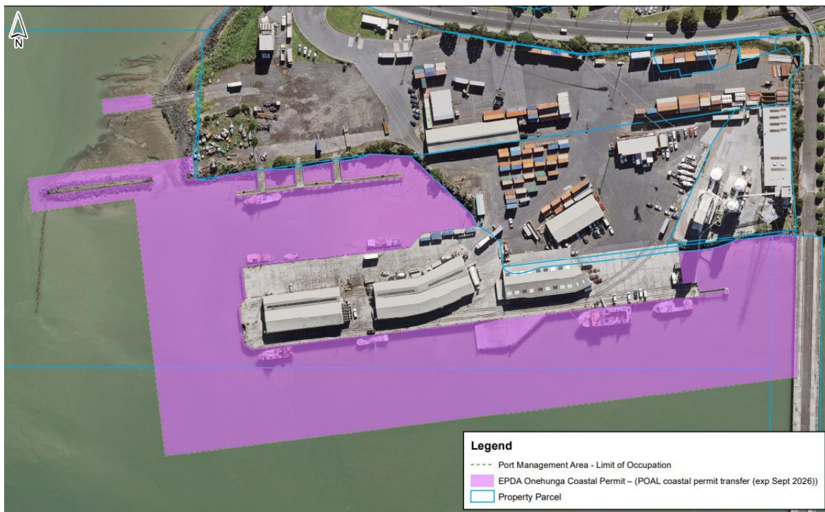
Figure 2: Occupation area in Manukau Harbour shown in purple